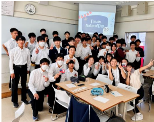
Taiwan National Day activities in 1S