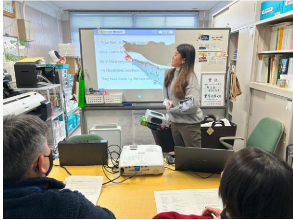
Second time of demonstration