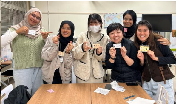
Learn Japanese in Literature class