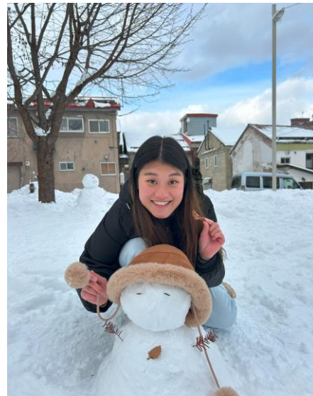
Hokkaido trip in winter vacation