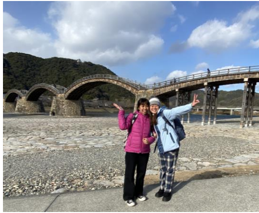
Two-day Hiroshima trip with my Japanese friend