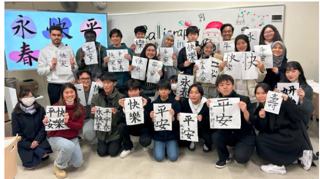
Teach everyone calligraphy with Taiwanese interns