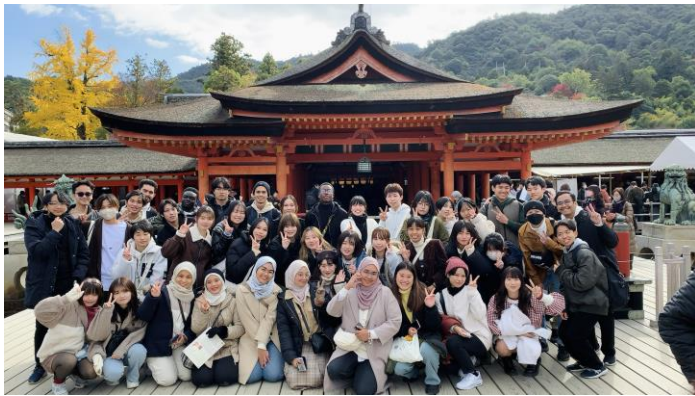
Miyajima trip with International students and Japanese students