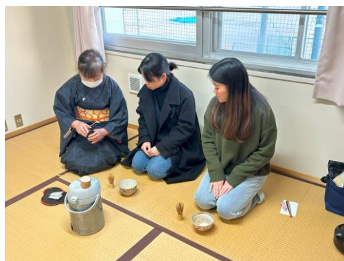
Tea ceremony experience