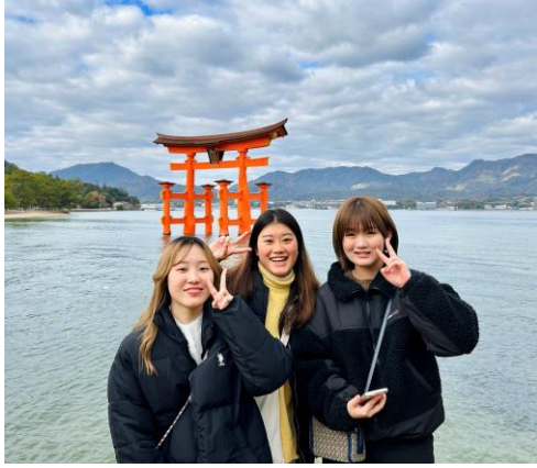
Miyajima trip with my students