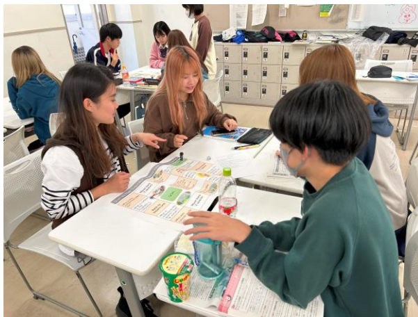
Participate students in classroom activities