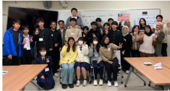
Friday Ni-Halo Class