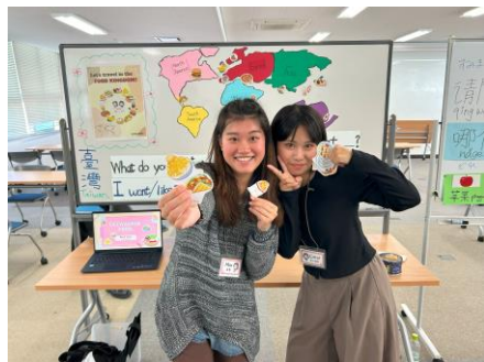
English activity on Open Campus