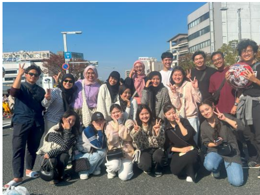
Participate in Ube Festival with Malaysian students