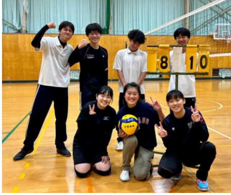
Join the volleyball club after school