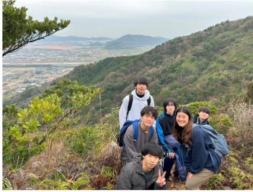
Mountain hiking experience