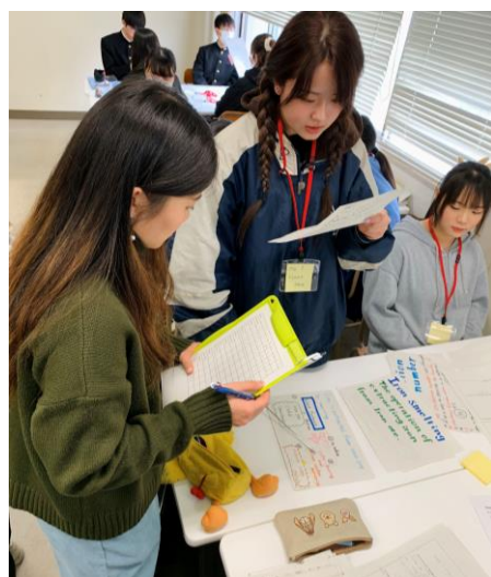
Giving feedback of students' report in Chemistry class