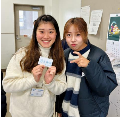
Students express her gratitude after the class