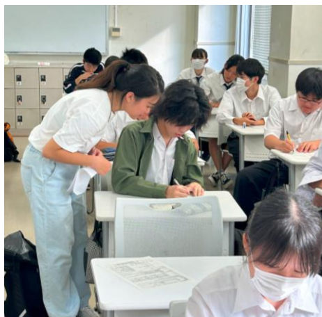
Assist students with exercises in class

international and Japanese students in the school, but I also learned a lot while spending time together. Beautiful friendships and memories, whether it is teaching gains or on-campus and off-campus courses and travel, are all indispensable during this five-month internship journey!!