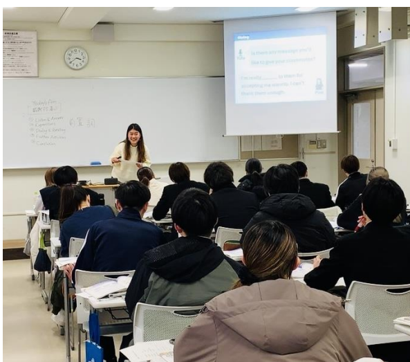
First time of teaching