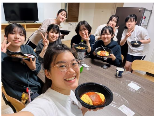
Dinner time with roommates